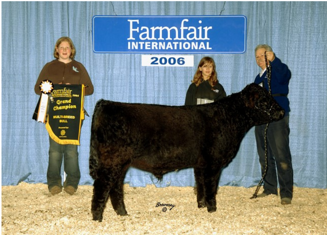
Big Deal Salvation 17S – Other Breeds Grand Champion Bull Farm Fair 2006 – as a calf