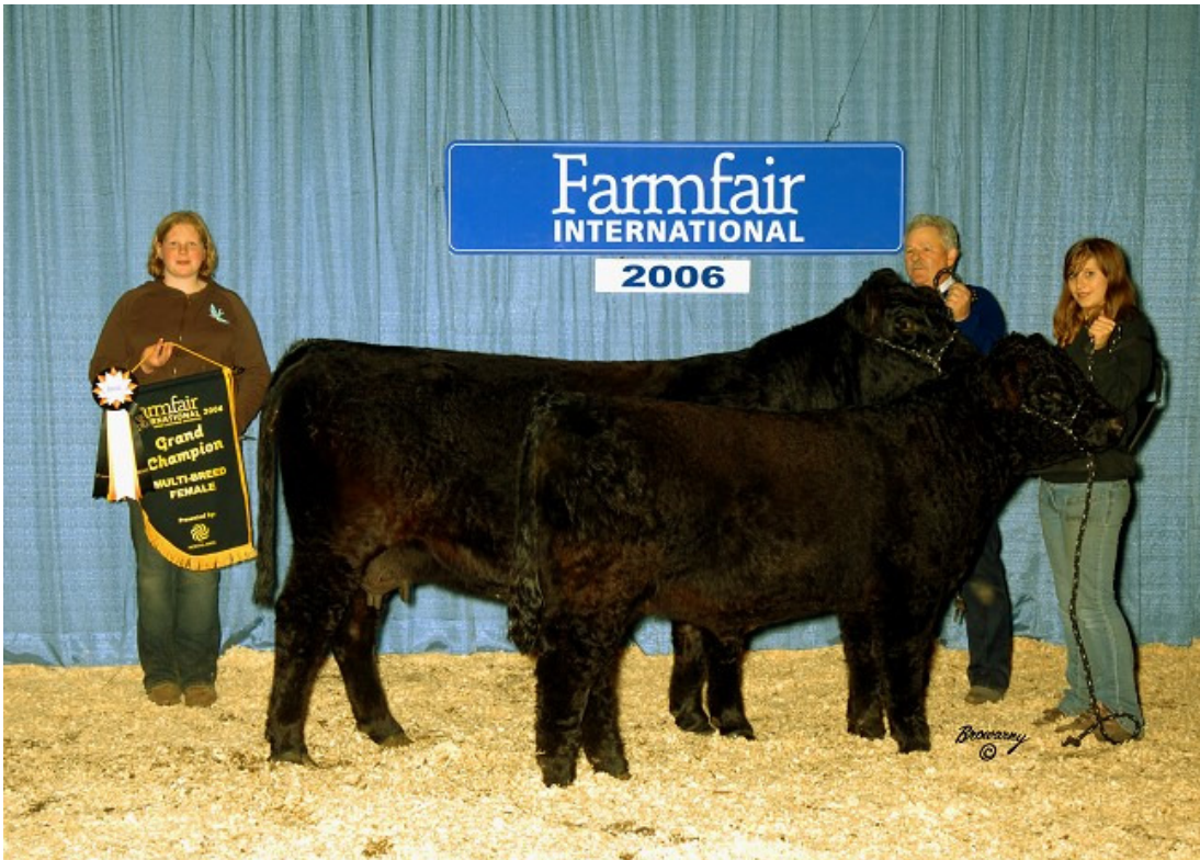
Big Deal Miss Hope 33M & Salvation 17S – Other Breeds Grand Champion Female 2006